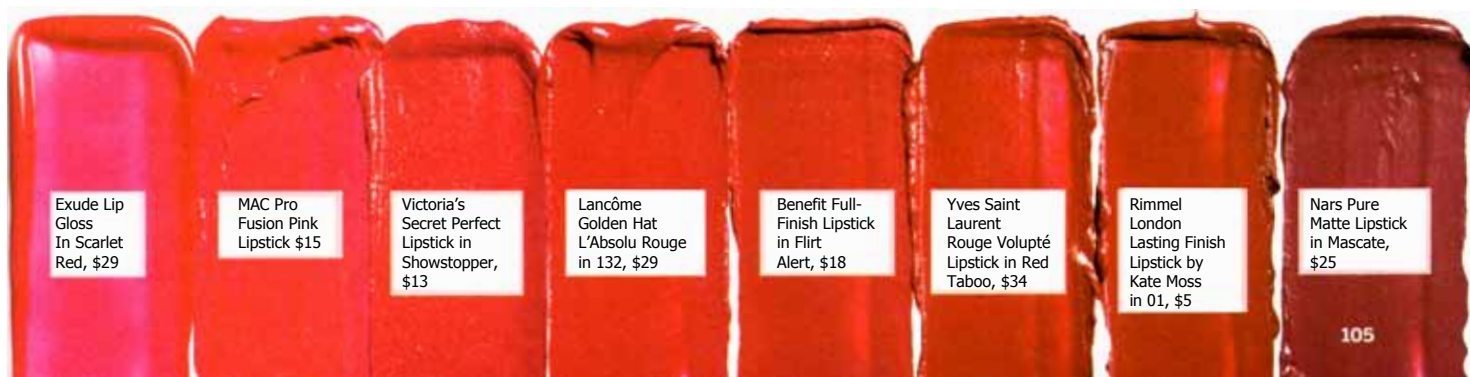
Exude Lip Gloss In Scarlet Red, $29

Deep red It's little surprise that the classic femme fatale color creates the ultimate sexy smile. Apply color with your finger for a lasting stainlike finish.